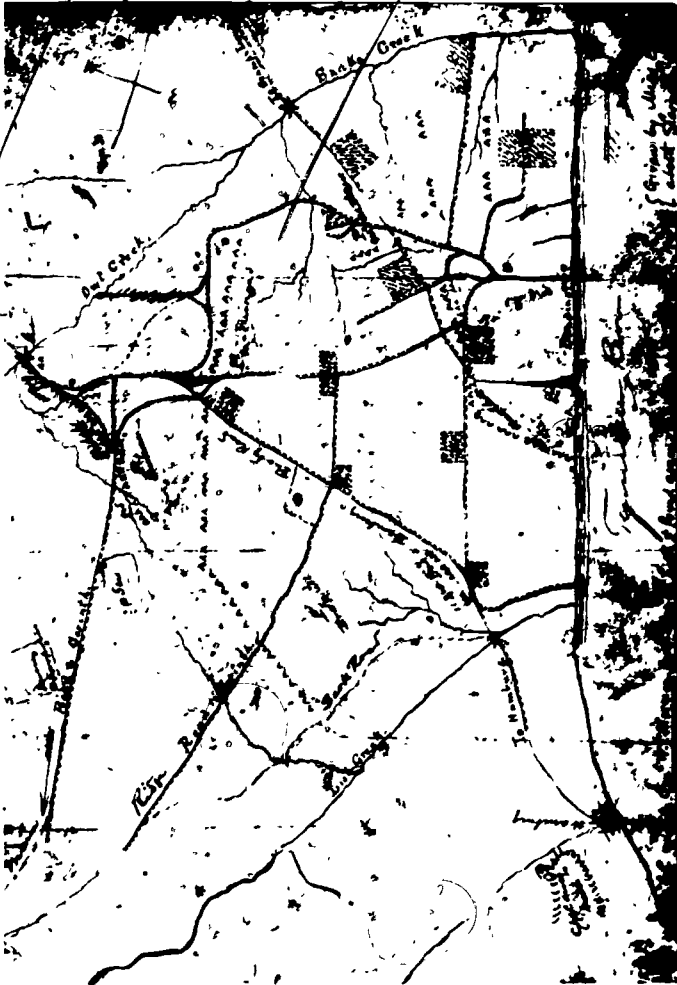
General William Tecumseh Sherman's sketch map of Shiloh used during the battle on April 6-7, 1862, and not in the O. R. Atlas .